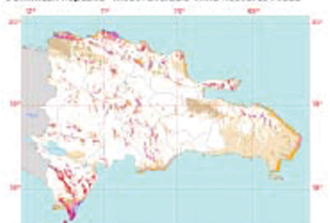
Dominican Republic - Most Favorable Wind Resource Areas